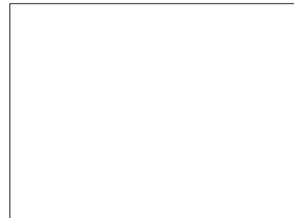
Figure 5: Significant caries noted on the mesial of a deciduous molar with soft-tissue ingrowth into the area.